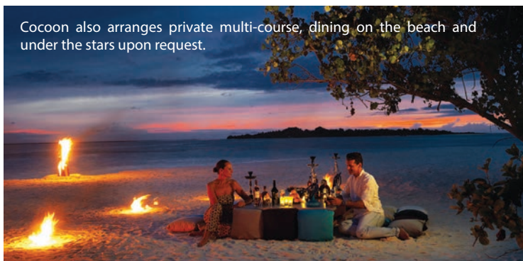
Cocoon also arranges private multi-course dining on the beach and under the stars upon request.

Close to the children's area, this is Cocoon's beach bar, replete with hammocks and lounge chairs. As well as a full bar, it serves fresh juices and snacks.