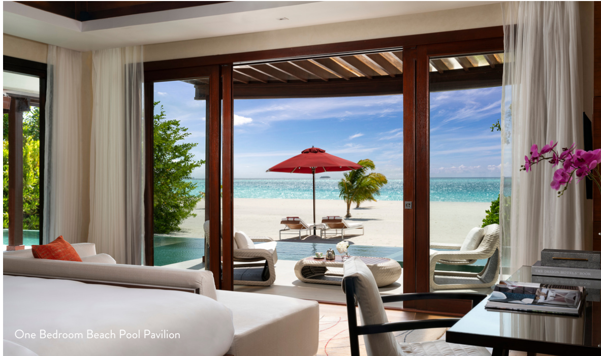
One Bedroom Beach Pool Pavilion