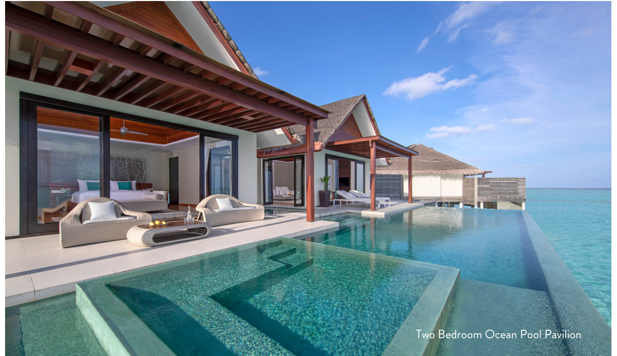
Two Bedroom Ocean Pool Pavilion

A stretch of beach to call your own, a pool and Jacuzzi that runs alongside it, and indoor - outdoor living and dining.